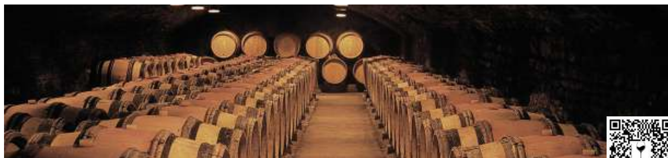
• Bouchard barrel hall

This sparkling wine perfectly embodies the House's commitment to showcasing grape varieties, delivering great complexity through its finesse while remaining approachable for all.