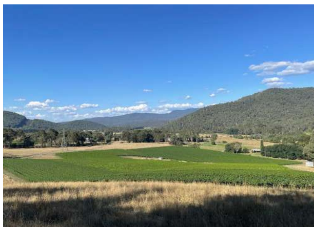
• Beautiful King Valley vineyards