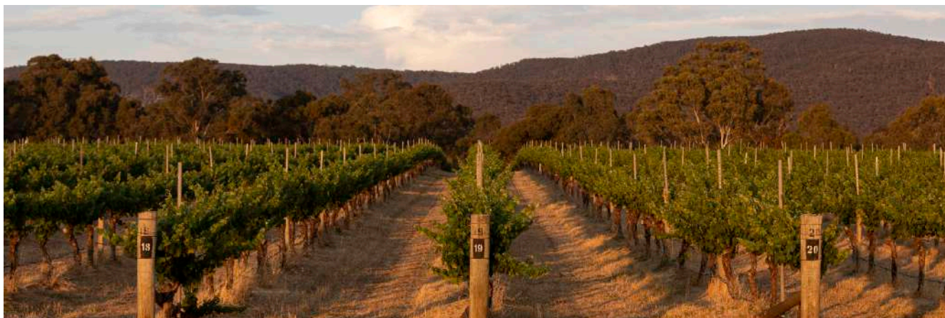
• Vineyards at the foothills of the Pyrenees