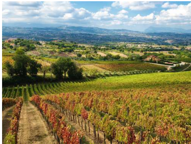
• The vines of Aglianico in the estate of Mirabella Eclano

The late ripening Aglianico, arguably the most exceptional variety grown in Irpinia, produces a rustic, earth driven, full bodied red with distinctive savory flavours of leather, white pepper, black fruits and cured meats. It has high tannins, high acidity and an aging potential of 20+ years. The most famous Aglianico is from Taurasi DOCG, grown in the volcanic hills of Avellino directly inland from Naples. Mastroberardino is undeniably the standout Aglianico producer making some of Italy's longest lived wines.