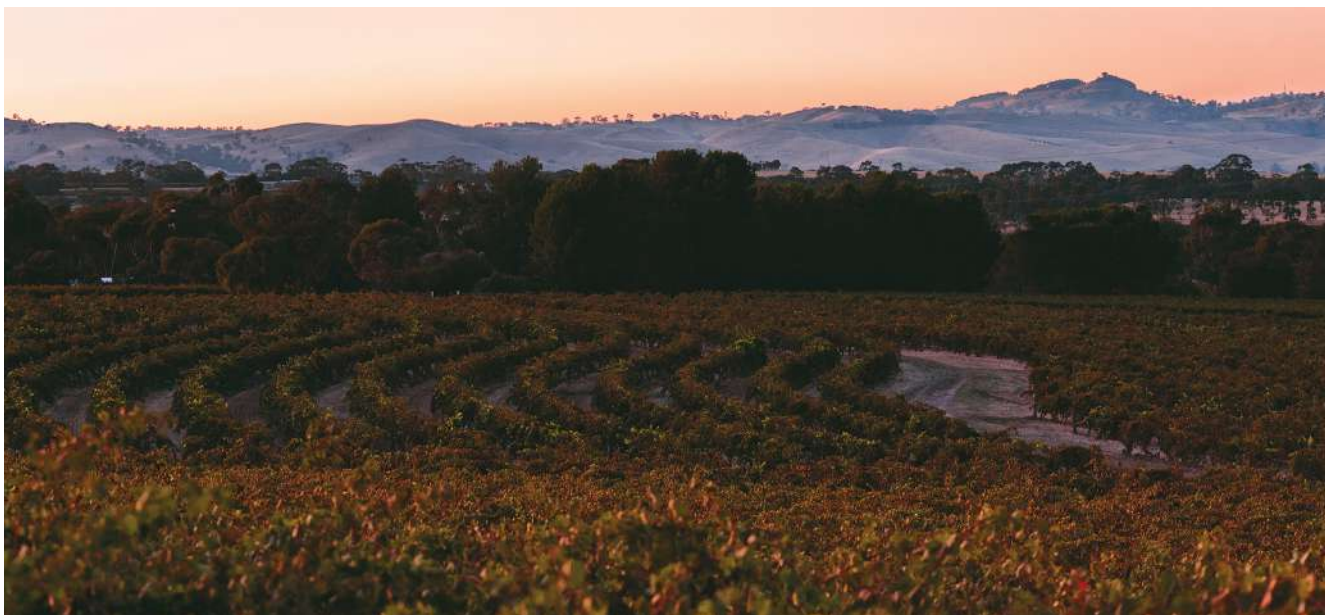
• Barossa Valley vineyards at sunset