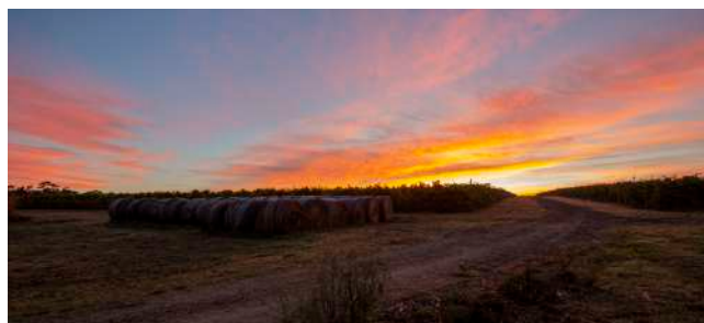
• Helens Hill Estate Vineyard