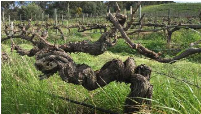
• 132 year old Block 6 Shiraz vineyard.

Fermented in the original open-top fermenters, Block 6 Shiraz showcases deep complexity, vibrant intensity, and a timeless connection to Kay Brothers' rich winemaking heritage.