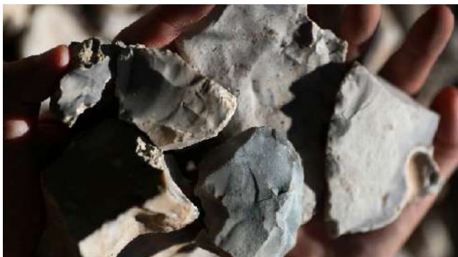
• Terrior Silex: grey, and pink silex (flint) stones

The vineyards of Domaine Fournier Père et Fils are evenly distributed across the three distinct terroirs of Sancerre, offering access to a diverse range of soils, slopes, and exposures. Located in a cool-climate region. Domaine Fournier follows organic (non-certified) methods that minimize chemical use. The region benefits from a variety of soils—Silex (flint), Caillottes (chalky limestone rocks), and Terres Blanches (calcareous marl)—as well as the unique microclimates created by its hills and the Loire River that runs along its right side. Starting in Sancerre, Fournier Père et Fils has gradually expanded its vineyards throughout the region, guided by the Burgundian philosophy of focusing on the distinct characteristics each vineyard and soil contributes to the wine. Today, Fournier produces a diverse range of wines, from entry-level offerings to single-vineyard selections, showcasing the remarkable variety of their terroirs.