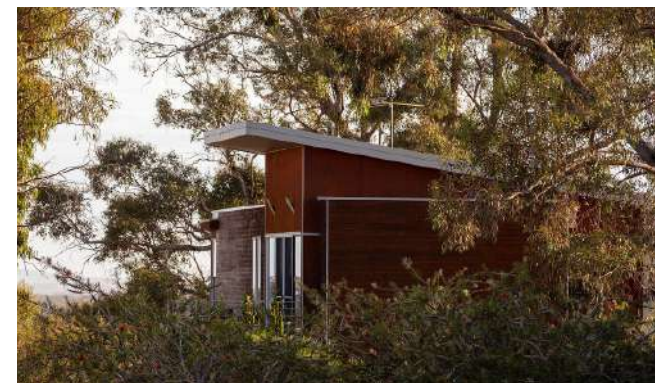
• Eco-Luxe Lodge Nestled amongst 600 olive trees in the foothills at Mount Avoca overlooking the picturesque vineyard and Pyrenees Ranges