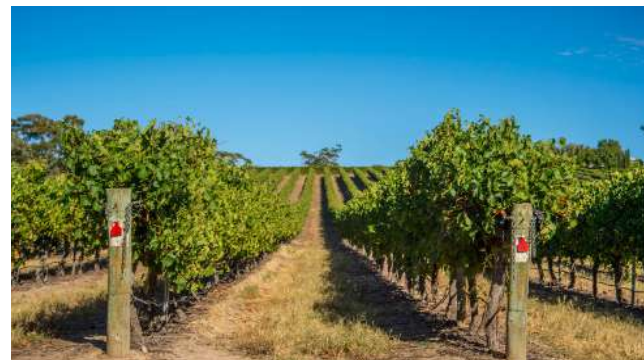
• Mr Mick Vineyard