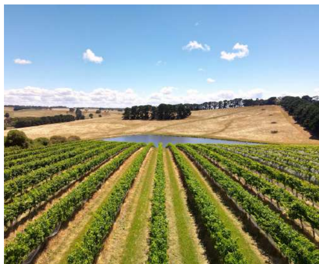
• Longboard vineyards Surf Coast, Victoria

"The Surf Coast Area of Geelong enjoys a slightly milder climate overall than other of the Geelong viticultural region. Being so close to Bass Strait, Bellbrae Estate experiences a maritime influence that reduces the risk of frost in Spring provides more even temperature ranges in Summer – ideal growing conditions for producing elegant wines that retain their natural acidity" Halliday Wine Companion, '21