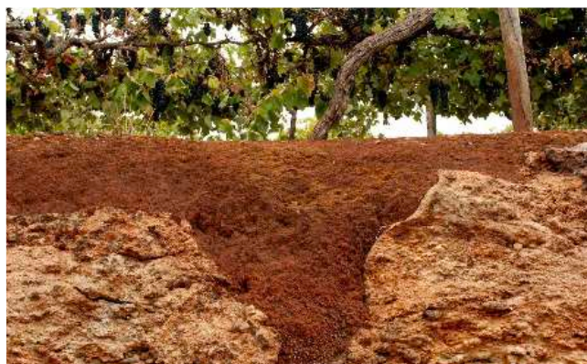
• Terra Rossa soil profile, red clay rich in iron oxide over limestone

With a winemaking philosophy that focuses on sourcing the best fruit possible, the Brand's Laira wines are classically Coonawarra in nature, combining the powerful influence of the rich red soils of the 'terra rossa', with skilled winemaking to create world renowned wines. Each range of Brand's Laira wine exhibits a shared standard of excellence and a distinctly Coonawarra style. Casella Family Brands is now the proud custodian of this iconic Australian winery, and are dedicated to its long-term commitment to producing world class wines.