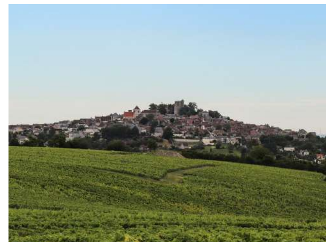
• Sancerre is a charming medieval village perched on its peak, overlooking the Loire.

Born from the magical alliance of the Sauvignon Blanc variety and the Loire terroir. With the expertise acquired in Sancerre, Fournier Pere et Fils offers sophisticated yet accessible wine, designed for daily pleasure.