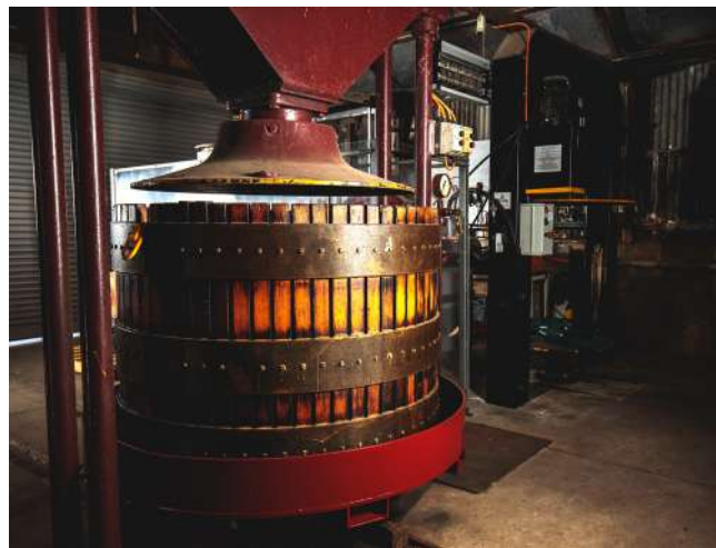
• Celestin Coq & Compagnie Basket Press in use since 1928

Installed in 1928 vintage to replace older hydraulic and manual screw presses that were unreliable. For winemaker Duncan, it is still the preferred of their two presses. The basket press reflects Kay Brothers traditional winemaking philosophy. The grapes are pressed gently, resulting in softer tannins and cleaner juice – as the juice is filtered through the mass of pulp while draining through the basket. Whilst this process is labour intensive and time consuming, Kay Brothers are confident it translates to superior quality.