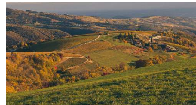
• La Collina dei Ciliegi vineyards