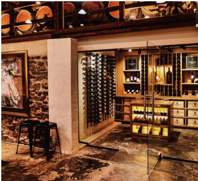
• Peter Lehmann Cellar Door, Tanunda, Barossa Valley