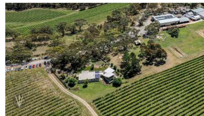
• Aerial view of the Kay Brothers Vineyard