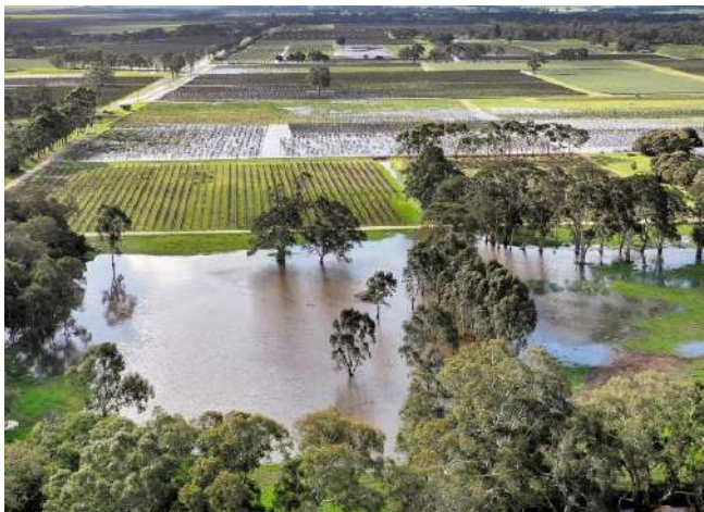
• Lake Breeze Flooded vineyards

Flooding is managed using a system of floodgates and banks that channel the river's winter flow onto the vineyards. The water saturates the soil over one to two days before being released to neighbouring properties. This process deposits nutrient-rich silt, maintaining soil fertility and enhancing the water-holding capacity of the alluvial silty loam, ensuring the vines thrive without supplementary irrigation.