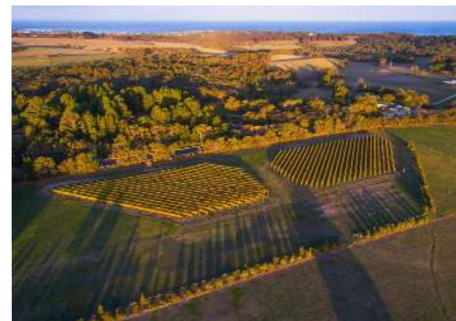
• Aerial view of the Bellbrae Estate vineyard.