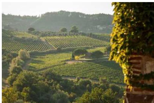
• Chianti's rolling vineyards