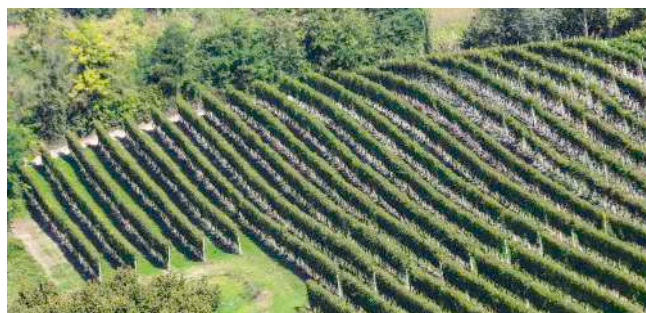
• Pico Maccario Langhe vineyards

In Monferrato, Pico Maccario owns the majority of the hundred hectares among Barbera, Viognier, Cortese, Sauvignon Blanc, and Moscato d'Asti varieties. Thanks to clayey and medium-texture soil, Pico Maccario wines are balanced and feature a modern, versatile style, but respecting the natural characteristics of the grapes and vines. All around the single vineyard estate, over five thousand rose plants and one thousand colored pencil poles bring joy and identify the history and the mood of Pico Maccario with total respect to the traditions.