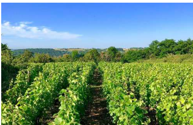
• Vineyards with a view in Bourgogne.