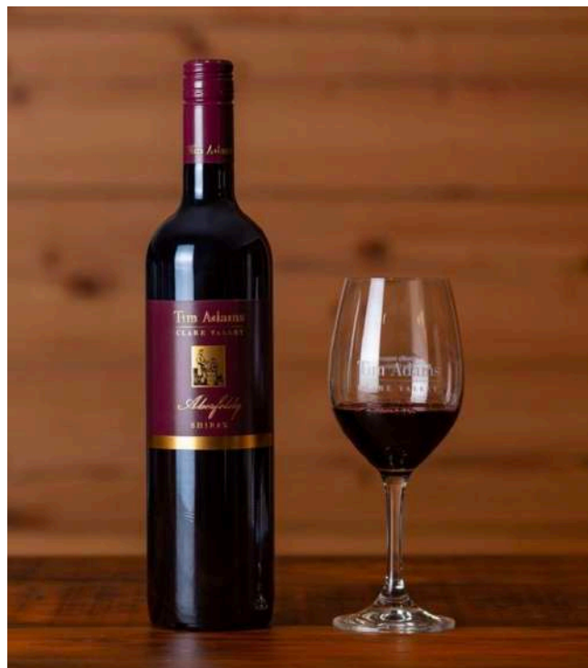
• The iconic Aberfeldy Shiraz – available giftboxed & in Magnums