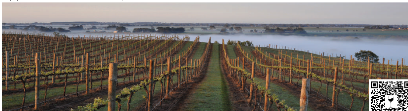
• Aerial view of the vineyard

"Most Successful Exhibitor" - Gippsland Wine Show 2022 & 2024