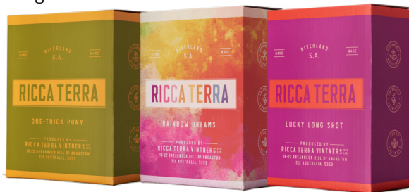
• Ricca Terra 3L Cask range

Longer shelf life: Ideal for tasting stock or sale by the glass, as cask wine remains fresh for up to three months after opening.